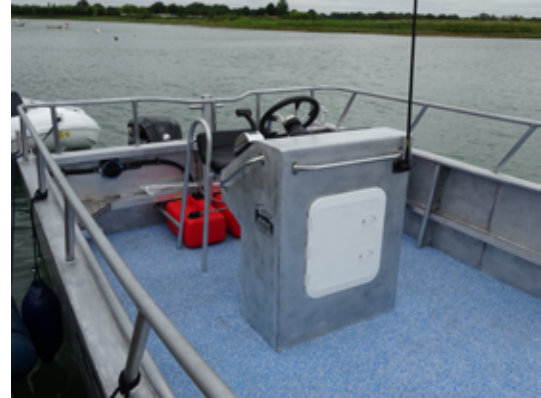
Large Open Cockpit

Aluminium Boatbuilding Co. Ltd. Mill Rythe Lane Hayling Island Hampshire PO11 0QG paul@abcsales.co.uk